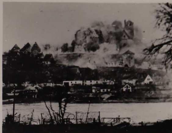
At ALT BREISACH, GERMANY, a Nazi CP across the Rhine is pounded into rubble by 105 mm Howitzers as the Germans and Yanks fight across the river.