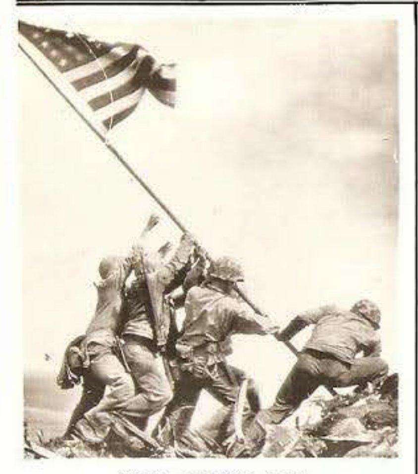
FLAG ON IWO JIMA

MILITARY COURTESY....a few words of warning! There is a General Order (ETOUSA) which states that within this theater, the rules and regulations on military courtesy and discipline will conform with War Department FM 21-50 and TF 21-2048. It further states that even minor offenses must not be overlooked, that every infraction must be dealt with promptly, and disciplinary action taken against any officer who tolerates such offenses. So .... practice your military courtesywithout fail! It's easy- if you STAY ALERT, and you must stay alert, for obvious reasons.