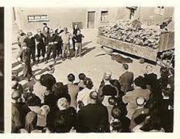
BUCHENWALD HORROR MILL

These photos were made in the Buchenwald Concentration Camp, near Jena. Many of these victims of Nazi atrocities died of starvation; others were brutally beaten and murdered. On the right German civilians are shown look-